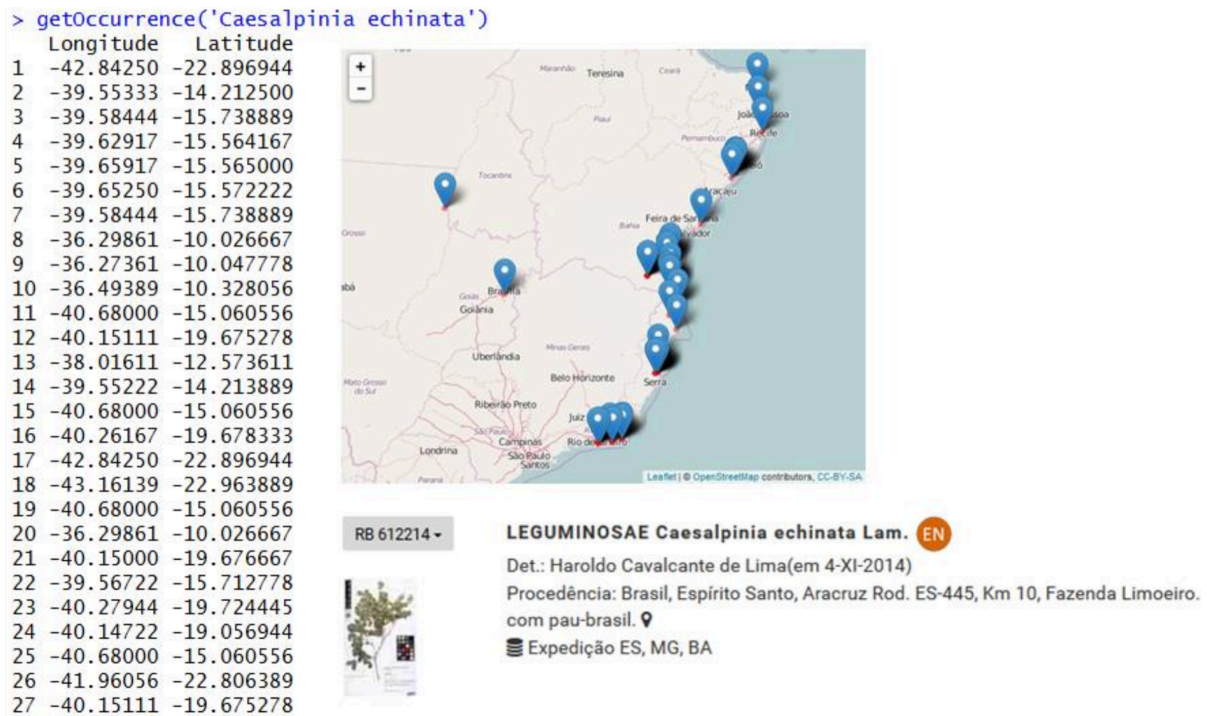
Fig. 1. Output of getOccurrence showing occurrence points obtained from Jabot.

were published by its Brazilian node, the Brazilian Biodiversity Information System (SiBBR) [10].